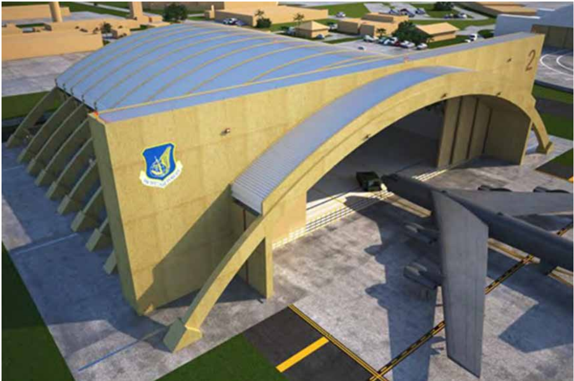
Figure. Hangar with HIPPO technology scheduled for construction at Andersen AFB, Guam. (From briefing, US Air Force Civil Engineering Command, subject: HIPPO JCTB, 10 September 2013.)

PACAF is implementing a dispersed basing strategy—pioneered in the Cold War but applicable today—to reduce the vulnerability of aircraft at bases within range of adversary missile systems. PACAF is investing significant resources into several forward locations. Furthermore, it is dusting off lessons learned from World War II and the Cold War to resurrect the ability to “flush-launch” (rapid engine start, taxi, and takeoff) alert aircraft upon receipt of warnings of tactical inbound missiles and continue to generate combat airpower despite missile attacks. Cope Sumo, PACAF’s new resiliency exercise concept, is based upon the successful Salty Demo exercise held in Germany (US Air Forces in Europe) in 1985. Cope Sumo will test our ability to rapidly disperse, flush, and recover aircraft within the theater.