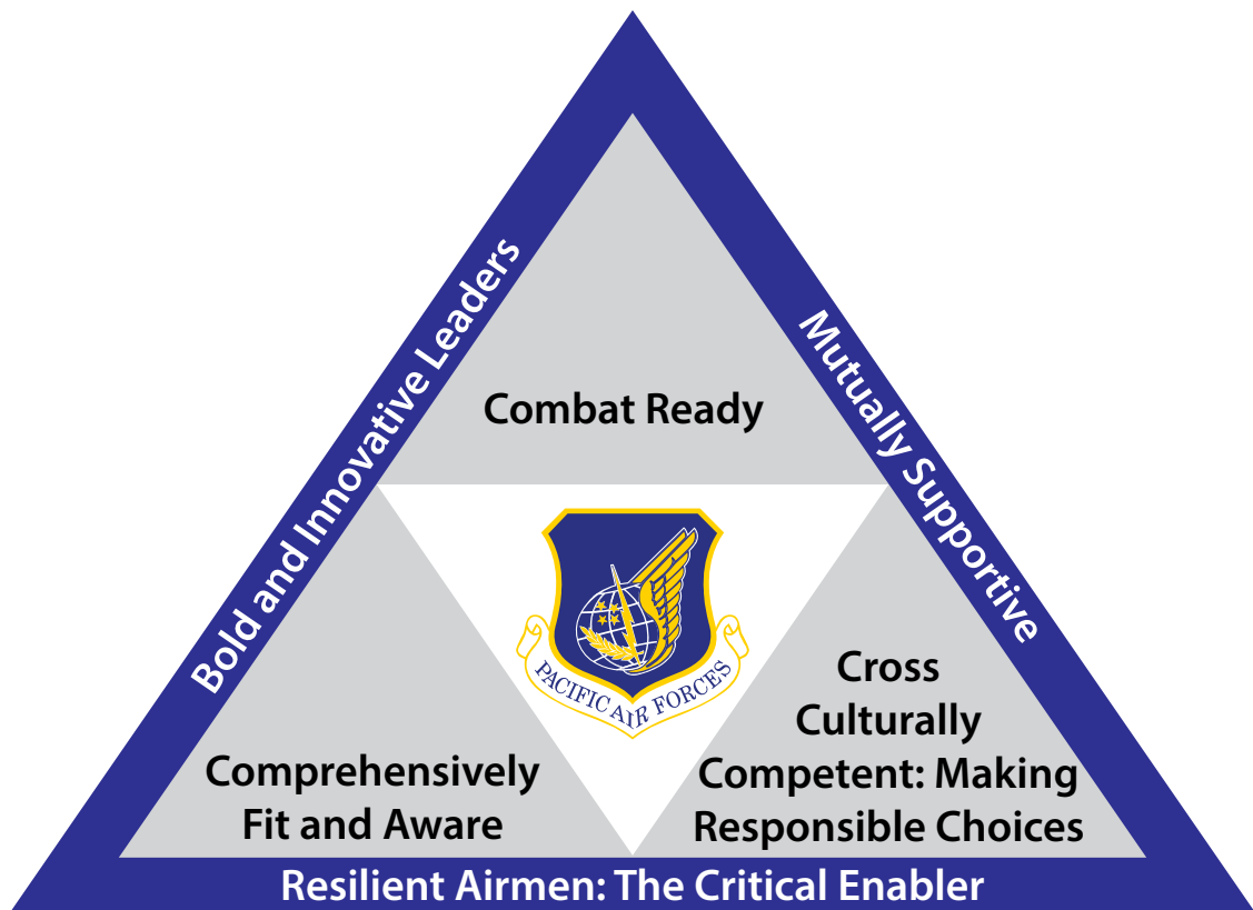
Figure. PACAF's model for resilient Airmen

RA strategy emphasizes three objectives: combat readiness, cross-cultural competence and commitment to making responsible choices, and comprehensive fitness and awareness. Using the RA road map, the RA OPG reaches these three strategic objectives through a number of initiatives.