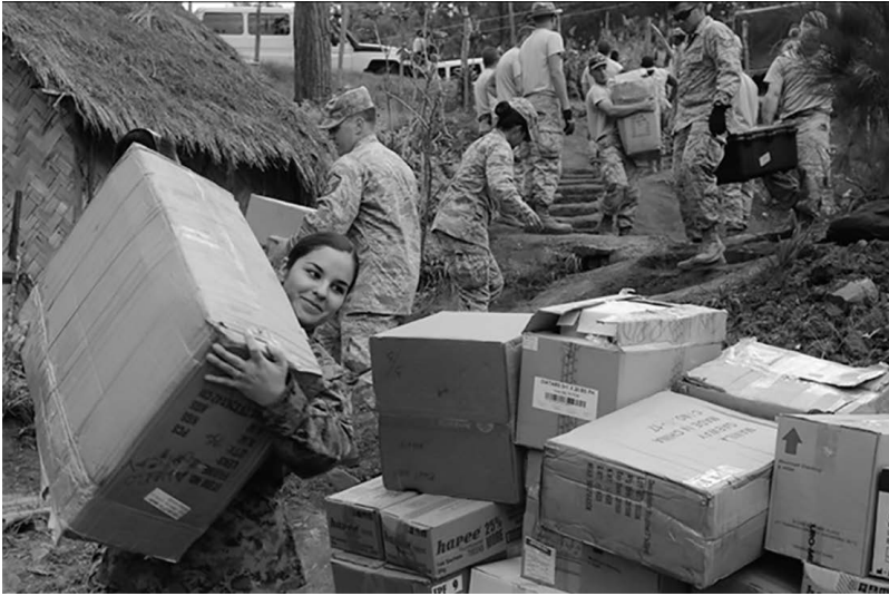
Figure 6. Operation Pacific Angel participants help improve Papua New Guinean school.

the interaction with you (IC) or spending time with others who are preoccupied, withdrawn, and cold to you, clearly focused elsewhere. Which treatment do you prefer? Similarly, the act of learning to behave ethically requires our entire humanity, not merely our intellect. Logical thinking alone is not sufficient grounds. If the use of intellect, of our reasoning capacity, alone were enough to guide us to a foundation of ethical soundness, it is worth reflecting that prior to the rise of the Nazis, the democratic Weimar government of Germany headed the most literate country in Europe. 185 In 1920, 12 years before the Nazi Party's democratically elected rise to power, highly respected German professionals Judge Karl Binding and medical doctor Alfred Hoche, of their own volition, wrote and published their rationally conceived booklet On Permitting the Destruction of Life Unworthy of Life . 186 From philosophy, we can get a clearer handle on the term "humanity." Plato viewed the whole human person in terms of his famous tripartite concept: