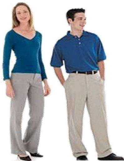
Operational Camouflage Pattern Uniform (OCP)

Civilian attire equivalent to AF uniform