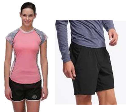
Fitness Uniform (PTUs)

Primed to prevail in competitive environments